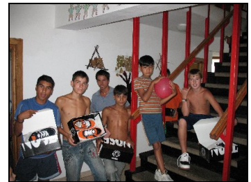
Perisorul children receiving new shoes

There are about 150 children who live at the Perisorul orphanage. During the summer very often the children will go and visit relatives or even parents, so there were about 70 children that stayed with us. These were ones that had nowhere to go. And to be sure every story of every child there is a tragedy with most not truly orphaned but rather abandon by their parents. Or a common story is that the children were taken from their parents by the state because the home situation was unspeakably bad and drew the attention of the authorities. In this case the state orphanage is a positive alternative, but to be certain the model of a large institution taking the place of a family is the least desirable. Currently four of our twelve children we have in Bethany House are from this same orphanage some the direct result of our mini-camps there.