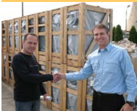
Receiving two brand new furnaces from Ferroli Romania

The difference between a house and a home is warmth.