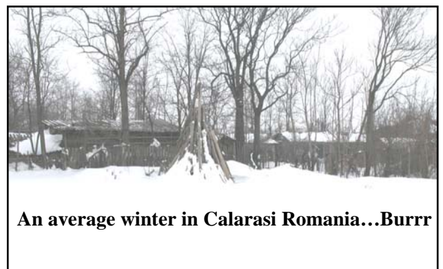
An average winter in Calarasi Romania...Burrr